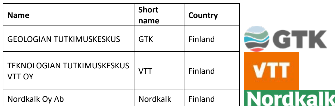
Table 3 The Consortium Partners of the MultiMiner project.

The project comprises the Consortium Partners listed in Table 3.